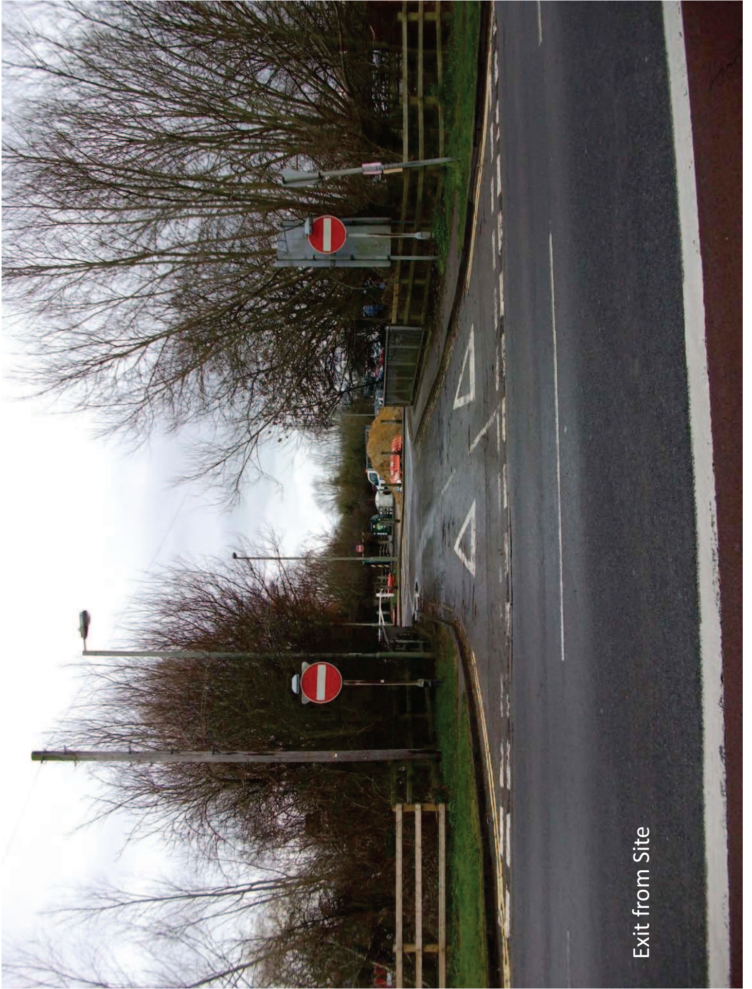
Exit from Site