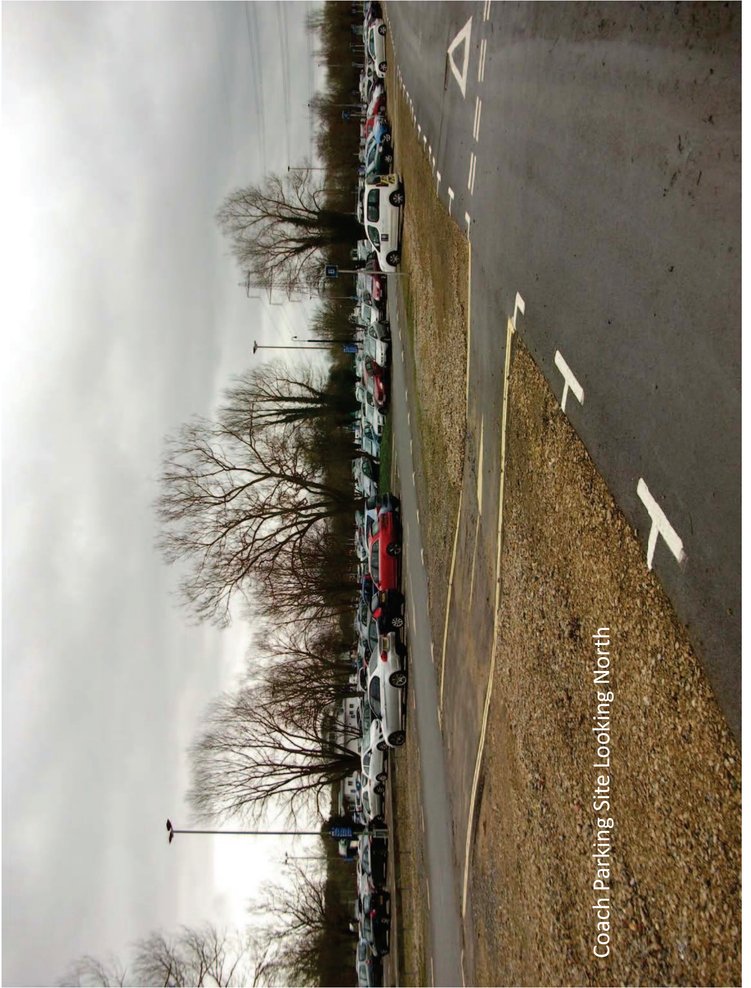
Coach Parking Site Looking North