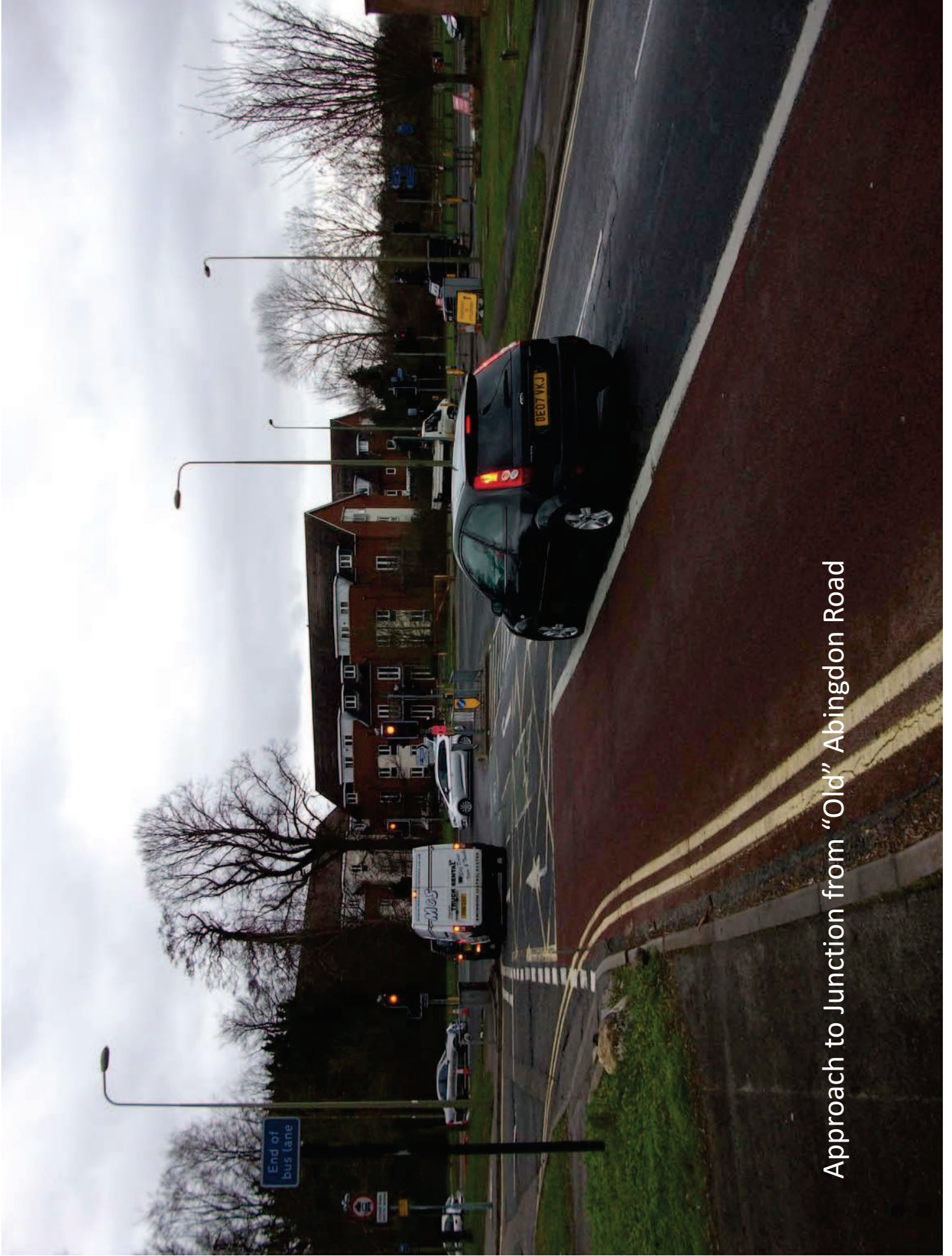
Approach to Junction from "Old" Abingdon Road