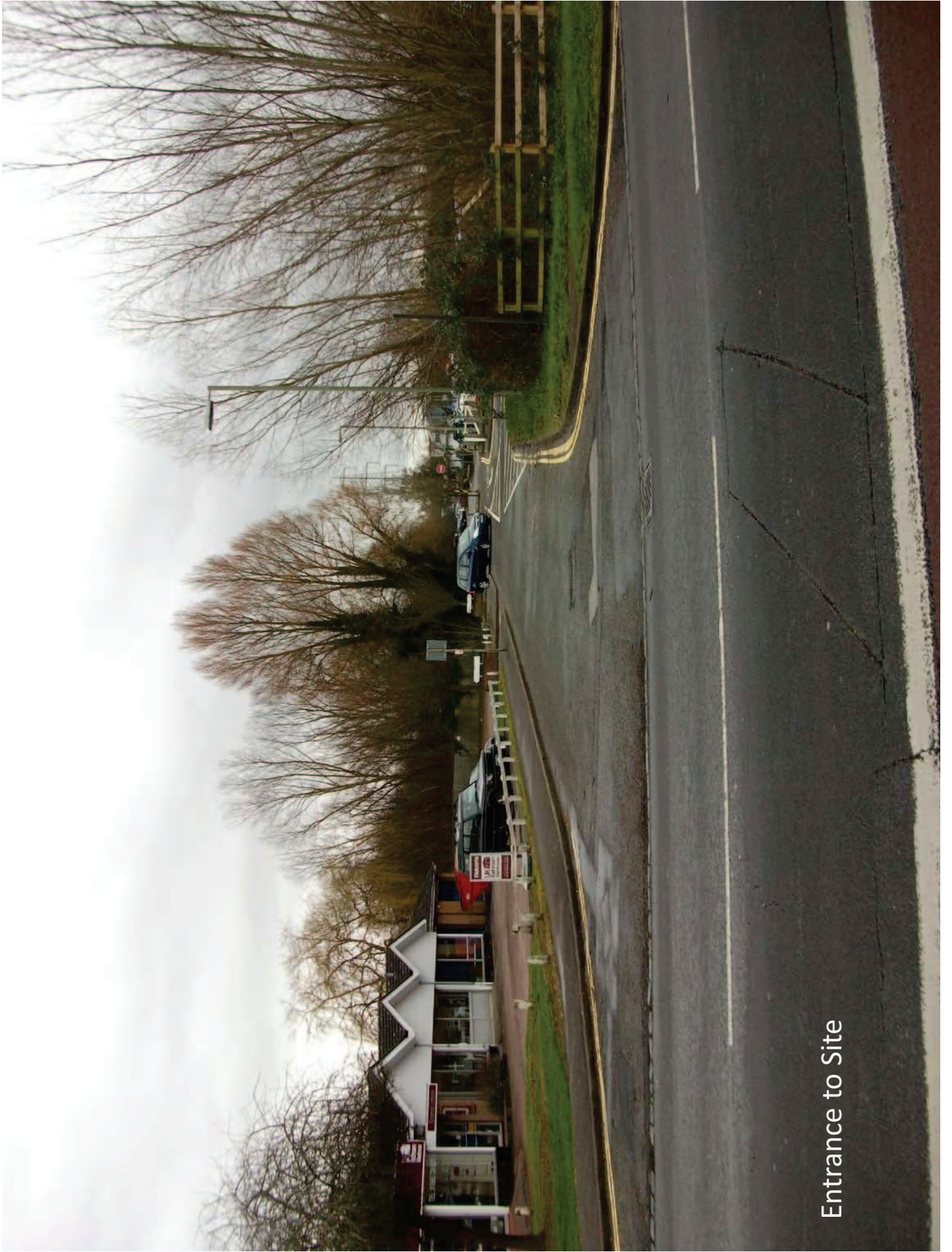
Entrance to Site