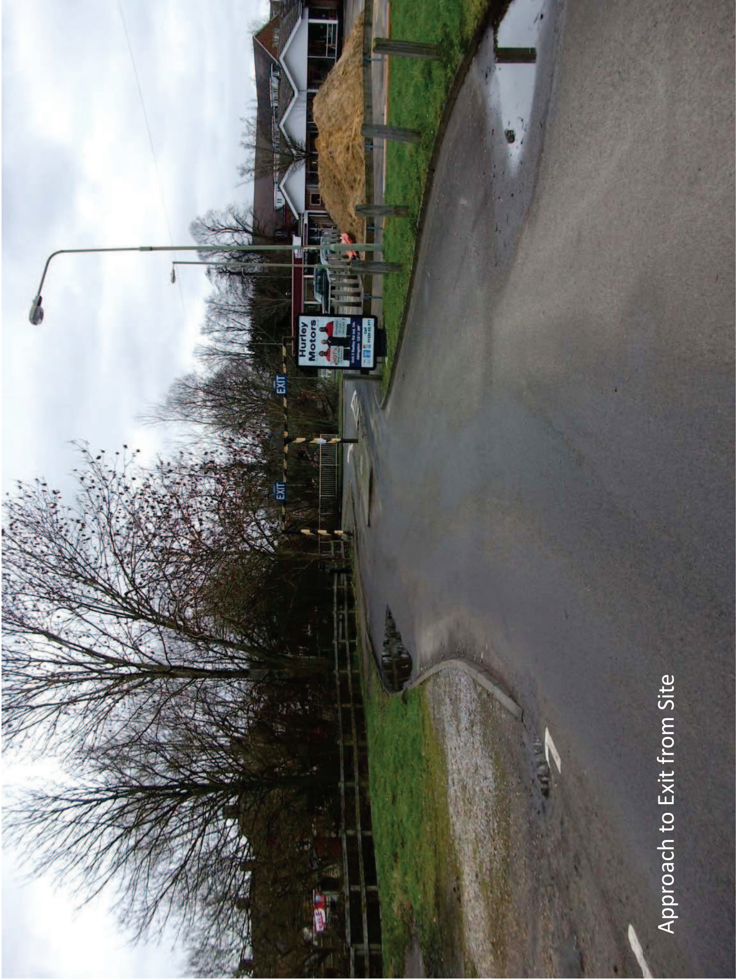
Approach to Exit from Site